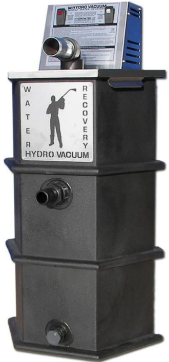
Easy to use, lighted vacuum switches control vacuum & pump out functions.

Additional information and video are available at http://www.hydrotek.us/pr/news.htm or contact the Inside Sales Department at (800) 274-9376 x3