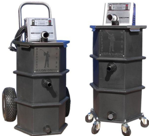
If your customer wants portability, choose one of the wheel kit options for indoor or outdoor use: dolly style or casters

The RPV includes a lift out basket strainer to protect the pump by collecting large debris