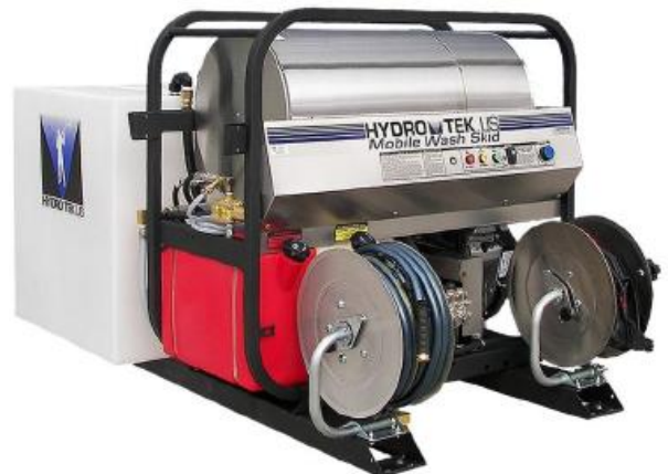
Pressure washers and reels sold separately